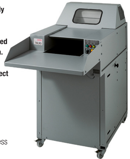
W/D/H 80/120 x 168 x 164 cm

The spacious feed table with integrated infeed conveyor belt provides controlled, effortless, safe and fast loading. The shredded material is collected in large-scale, mobile or swing-out containers under the cutting mechanism. The shred-press combinations are coupled to a baler for immediate fully automatic compaction of the cut material into compact bales. Reduction effect compared to the loose collection of the cuttings is about 70%.